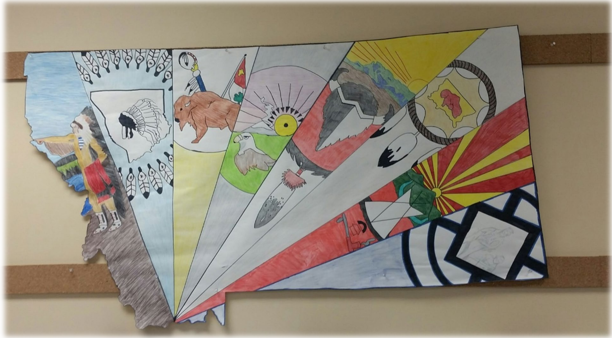
Artwork by Carroll College Education Students